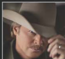
ALAN JACKSON ASCAP Founders Award