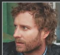
DIERKS BENTLEY Songwriter/Artist of the Year