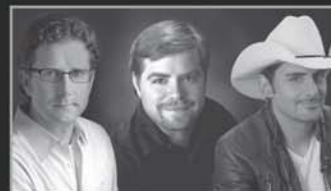
SEA GAYLE MUSIC Publisher of the Year