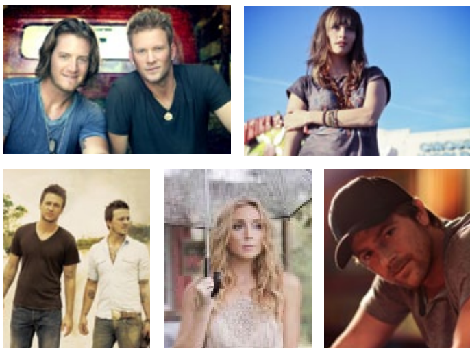
(Clockwise: Florida Georgia Line, Kacey Musgraves, Love and Theft, Ashley Monroe and Kip Moore)

Eligibility Period: May 1, 2012 – April 30, 2013