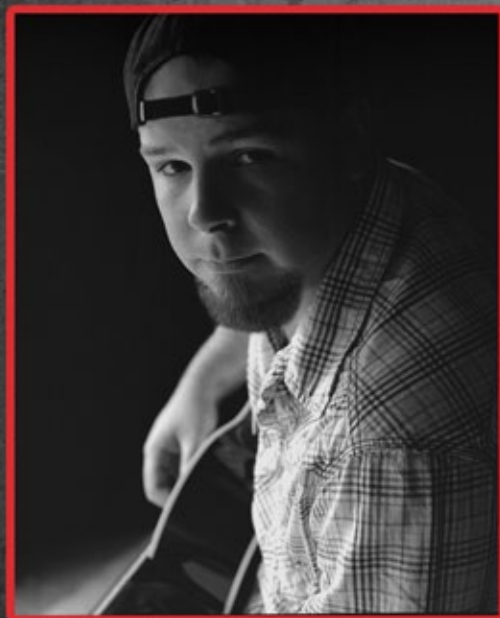
CHRIS TOMPKINS SONG OF THE YEAR "BLOWN AWAY"