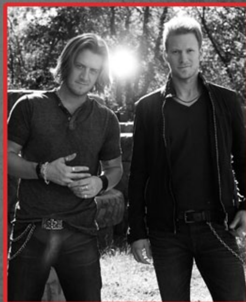
FLORIDA GEORGIA LINE BREAKTHROUGH ARTIST