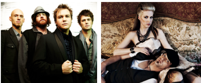
(Clockwise: Brantley Gilbert, Kip Moore, Scotty McCreery, Thompson Square and Eli Young Band)