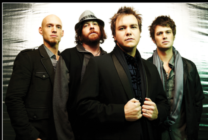
ELI YOUNG BAND (Republic Nashville)