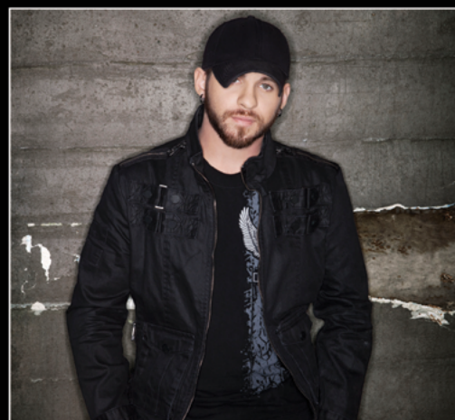
BRANTLEY GILBERT (The Valory Music Co.)