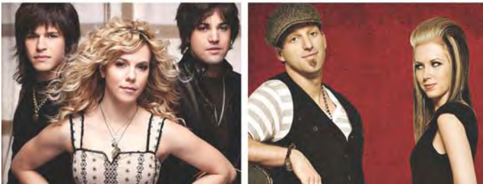
(clockwise): Easton Corbin, Jerrod Niemann, Steel Magnolia, Thompson Square and The Band Perry.