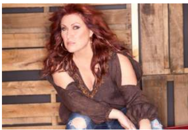
Jo Dee Messina

Jo Dee Messina will treat guests of MusicRow 's 3rd Annual Rising Women on the Row ceremony to a sampling of her latest music with an acoustic performance at the March 21 breakfast.