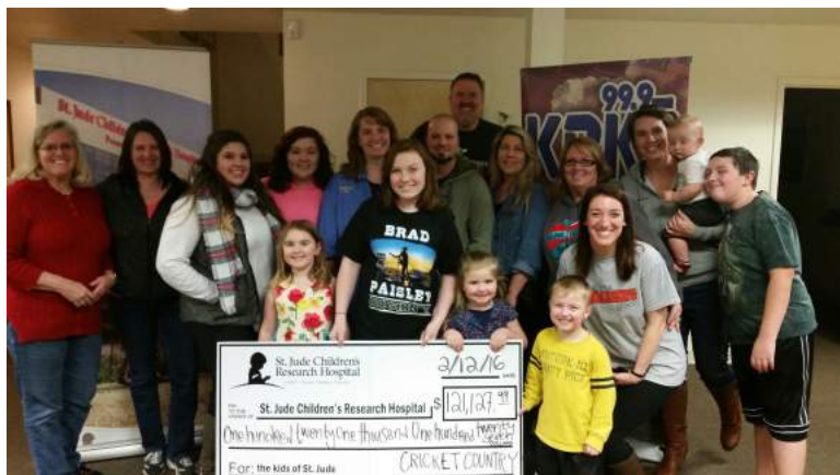
KRKT/Albany, OR held its 14th annual St. Jude Radiothon Feb. 11 & 12, 2016, where all proceeds go to St. Jude Children's Research Hospital. This year KRKT and the Cricket Country community raised $121,127.99!