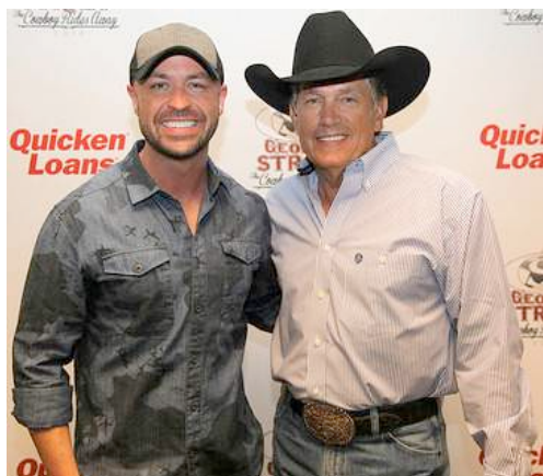
CMT After Midnight's Cody Alan joined Country legend George Strait at his The Cowboy Rides Away Tour stop in Los Angeles at the Staples Center.

Tracy Lawrence /Lie/Lawrence Music Group