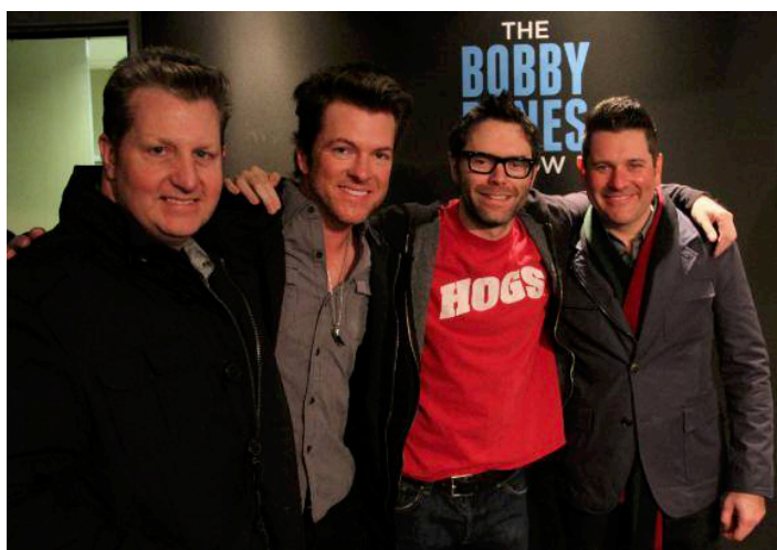
Rascal Flatts visited Bobby Bones' studio for the iHeartRadio World Premiere of the trio's new BMLG single "Rewind." Pictured (L-R): Gary LeVox, Joe Don Rooney, Bones, Jay DeMarcus